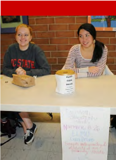
ELMO Coin Drive