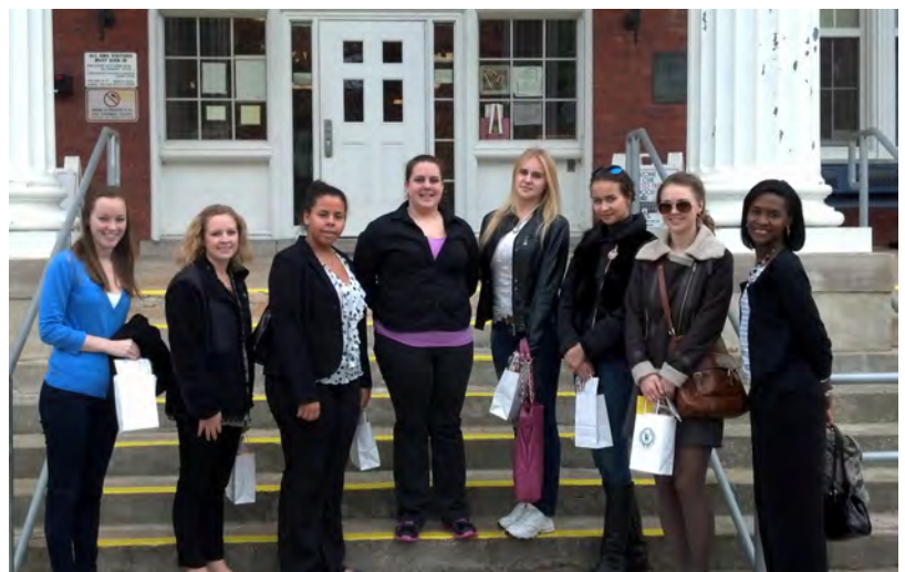
Passport to Success Wake Young Women's Leadership Academy School Visit