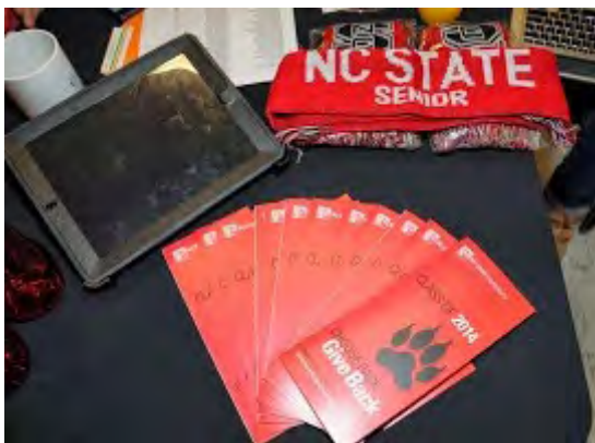
Senior Gift Campaign