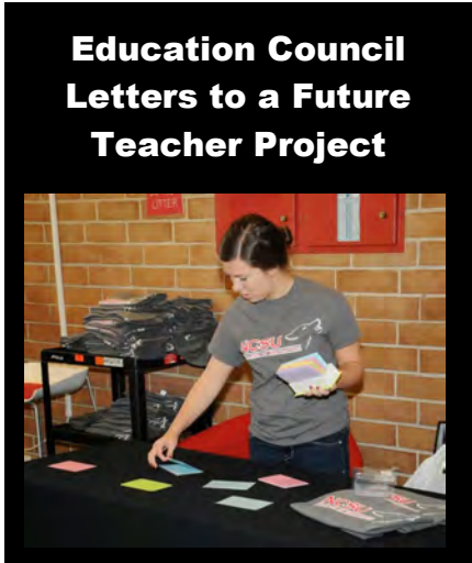
Education Council Letters to a Future Teacher Project