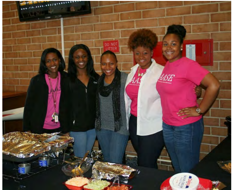
AAASE Taco Bar