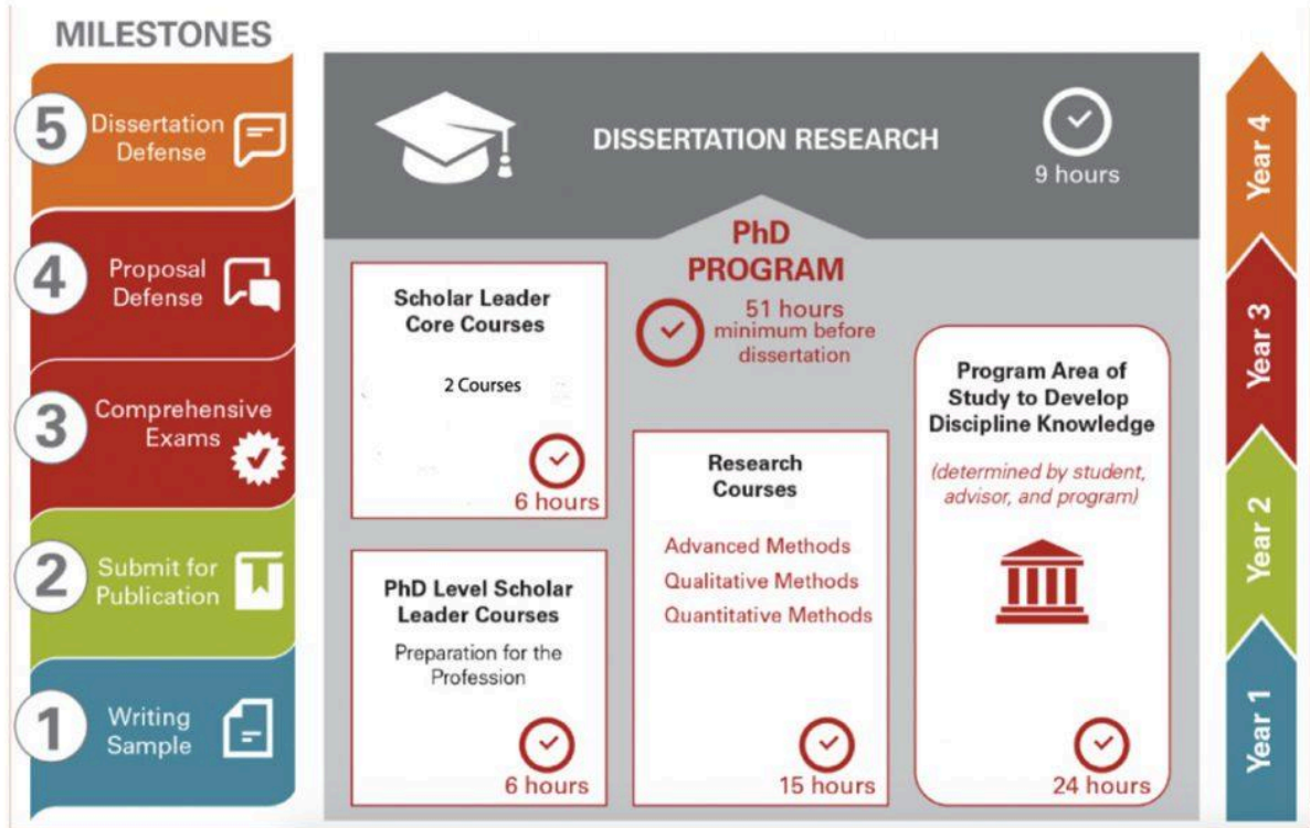
Figure 1. Common Elements of PhD Programs across College (Full-time)